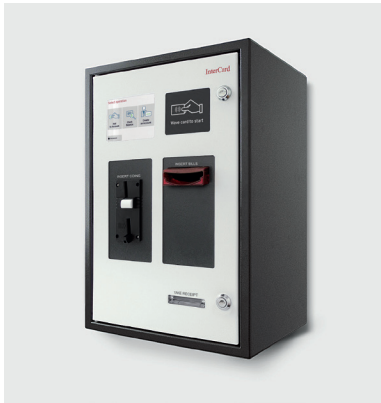
load.UP basic unit

Measurements (H x W x D): 560 x 370 x 305 mm Weight approx. 18 kg