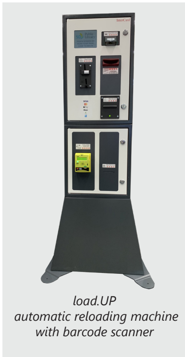
load.UP automatic reloading machine with barcode scanner

Alternative authentication via barcode or magnetic card