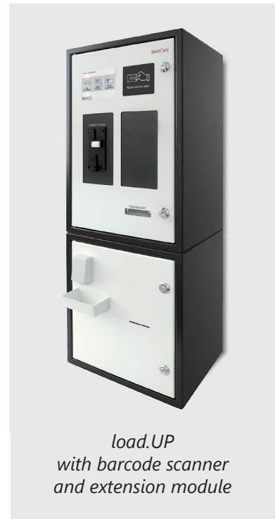
load.UP with barcode scanner and extension module