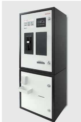
load.UP with extension module for issuing cards and coins

Measurements (H x W x D): 560 x 370 x 305 mm Weight approx. 18 kg